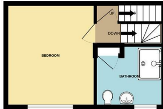
1ST FLOOR 236 sq.ft. (22.0 sq.m.) approx.